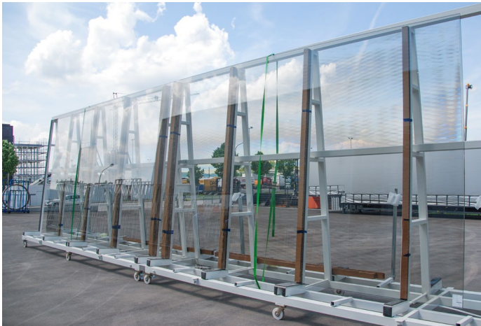
Figure 1: Sample pane with conspicuous optical distortions (anisotropies)

Glass is optically isotropic: Light is transmitted uniformly, the refractive index of light rays is identical in every direction (from Greek isos = equal, tropos = direction, rotation). When the glass is under stress,